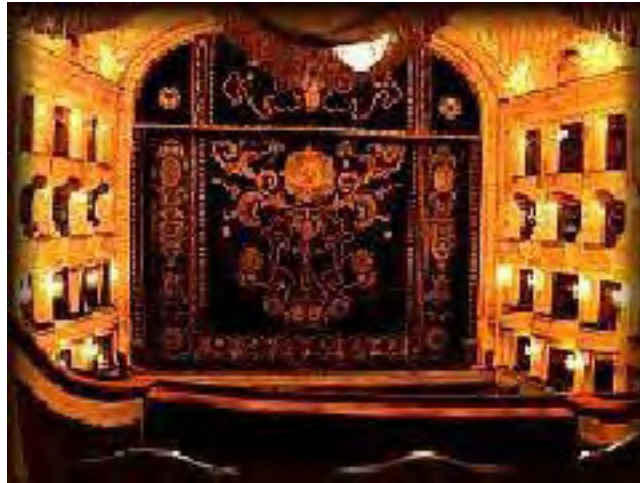
The grand proscenium of the Odessa Opera House, with private balcony boxes on both side walls.

But let me beg you to take this simple message to Jesus who is crying out in grief. He is waiting for you to act. May Jesus plant his seed of love within every man and woman of good will!"