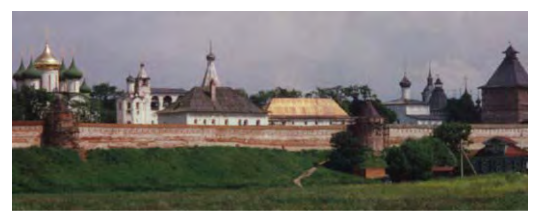
A view of the Susdal Monastery from outside the perimeter walls.

Tears were shed in Archangelsk when word of his banishment reached those who loved him. For his parents, the news was a mortal blow. Three months later his mother died of grief, and soon afterward his embittered father, who made repeated unsuccessful petitions on his son's behalf, gave up and died of a broken heart too.