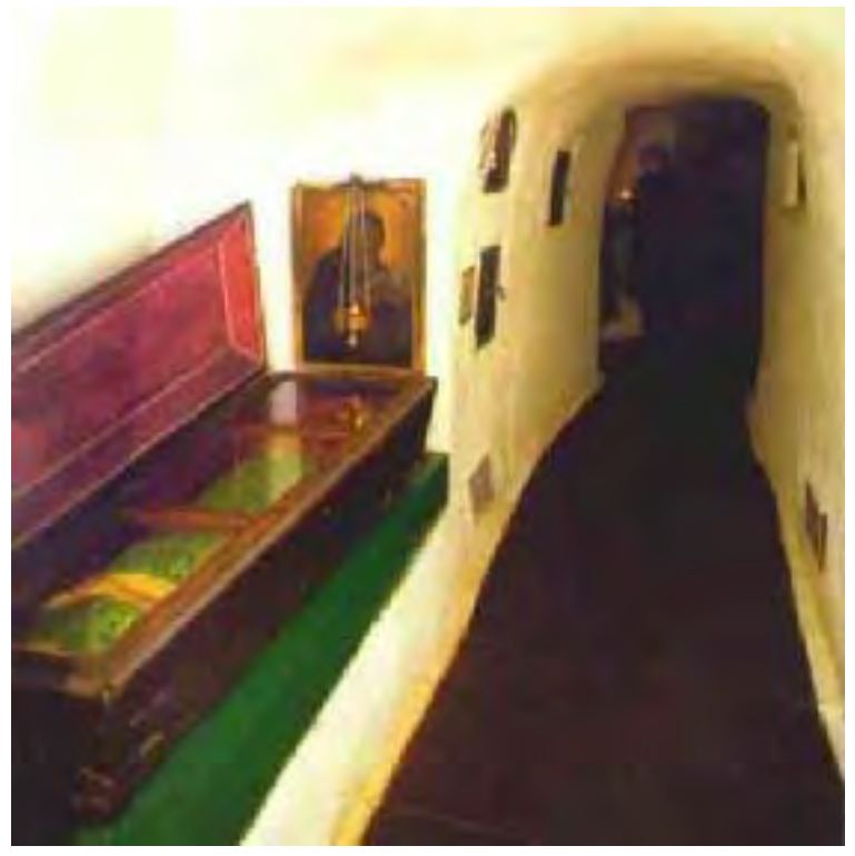
A passage in the Caves of Lavra, where entombed saints still draw throngs of tourists and pilgrims.