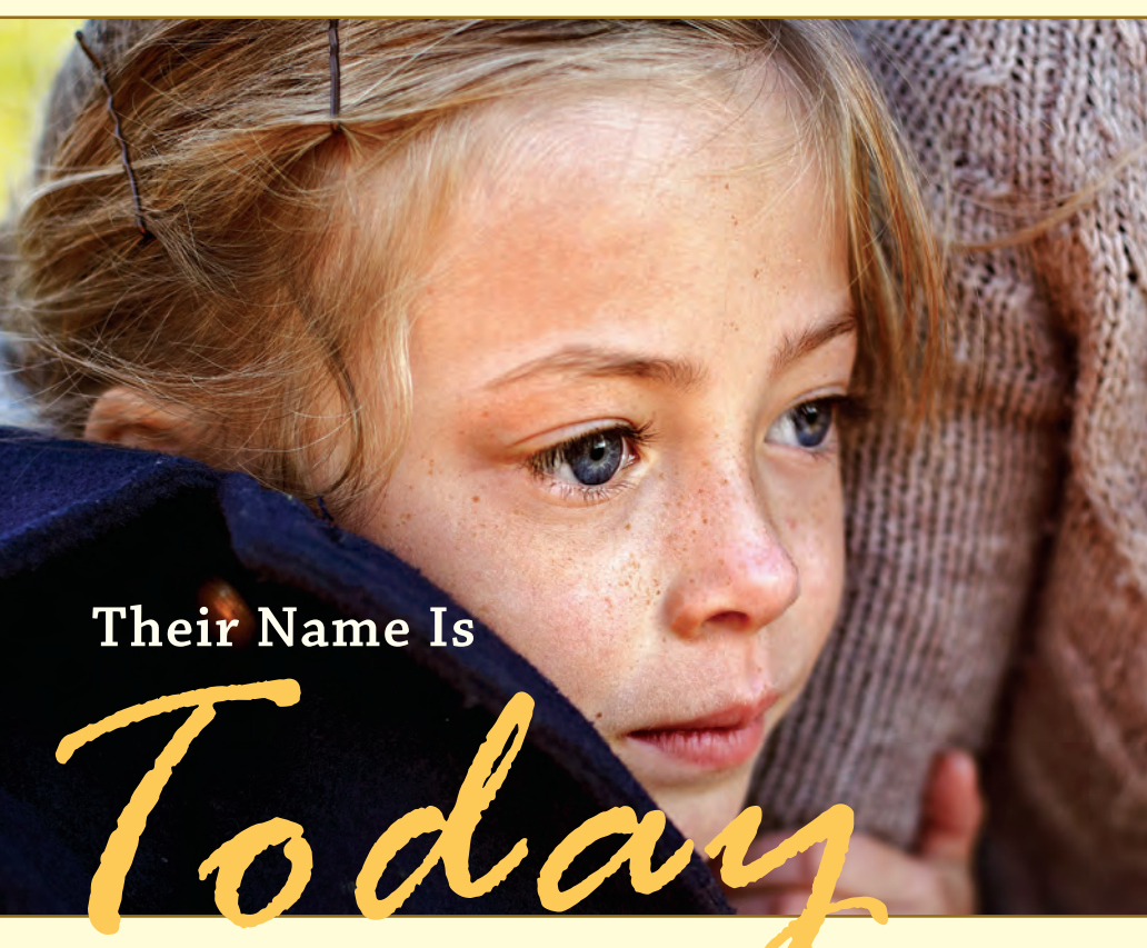
Reclaiming Childhood in a Hostile World