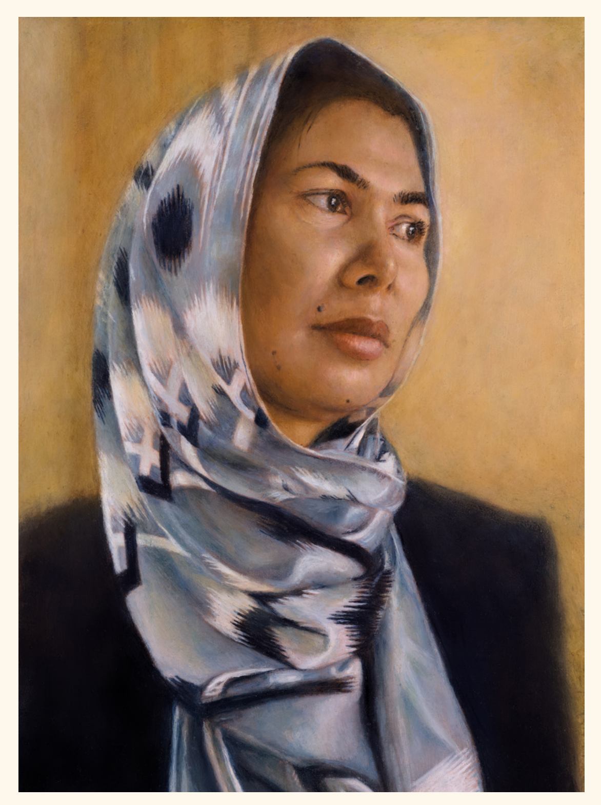
Tursunay oil and tempera on panel, 2022